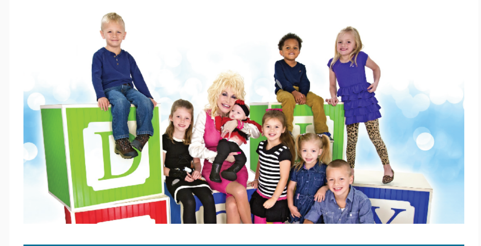
Use the Whisper Effect Your May 2024 reading tip

You can also visit us at www.ImaginationLibraryRVA.org.